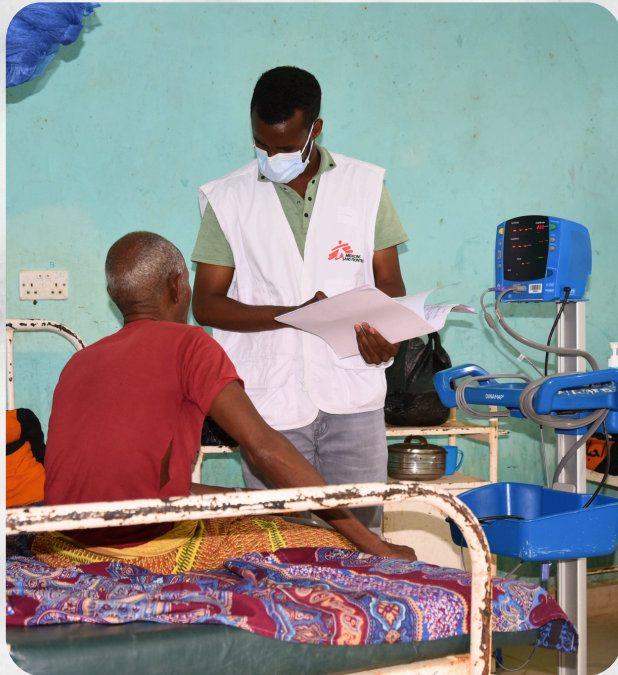
DAGAHALEY CAMP, DADAAB